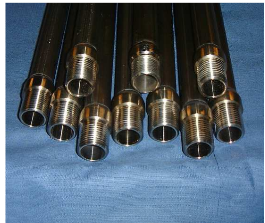
Protection tubes with threads, the other end closed