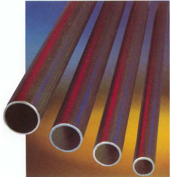
Straight tubes with open ends or with one end closed