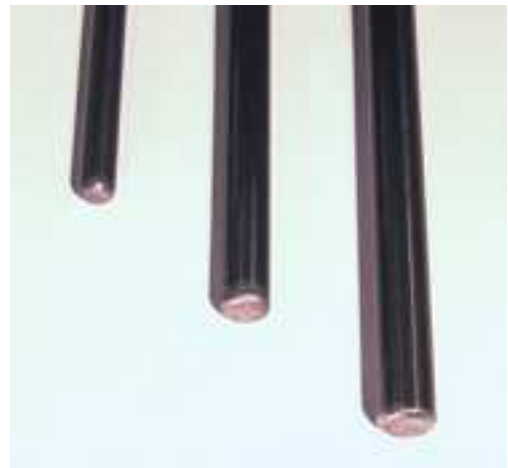
Protection tubes with welded endcaps